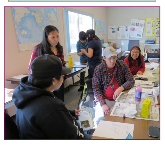
Students do hands-on chemistry experiments as part of their Science lessons.